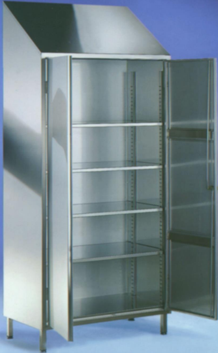
ART. INOX X2003BA

TODAY OUR PRODUCTION CAPABILITIES HAVE GROWN TO ALMOST 500 UNITS PER MONTH.