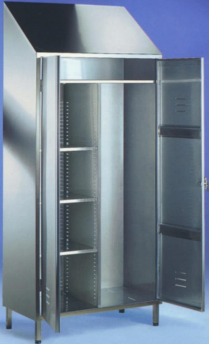
ART. INOX X2002BA

OUR CUSTOMERS BENEFIT FROM OUR EXPERIENCE IN THE FOOD PROCESSING SECTOR AND FROM OUR ATTENTION TO TECHNOLOGICAL INNOVATION.