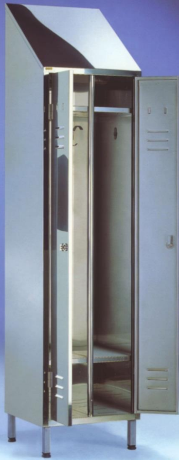
ART. INOX X1009BA