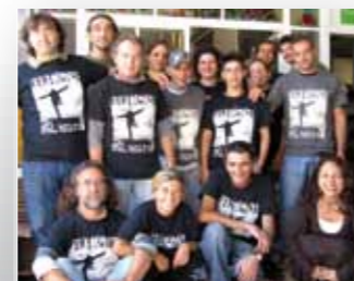
in co-operation with Cooperativa Etabeta