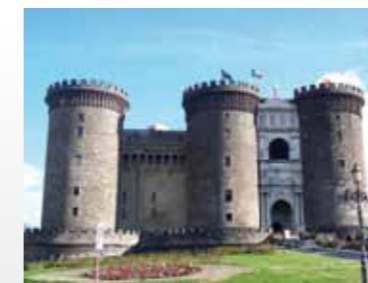
Maschio Angioino Napoli