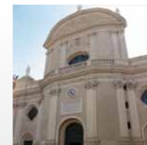
Duomo San Giovanni Battista (Imperia)