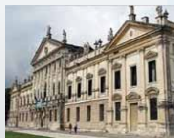
Villa Pisani Stra (VE)