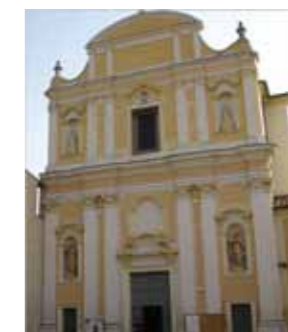
Parrocchia di San Biagio - Cavriana (MN)