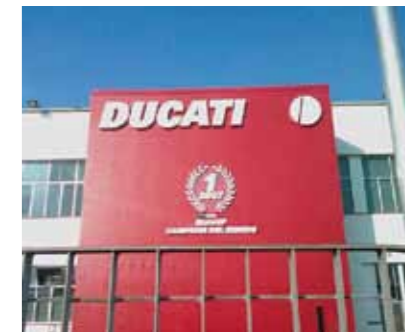
Ducati Motori Bologna