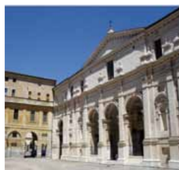
Basilica di Santa Barbara Mantova