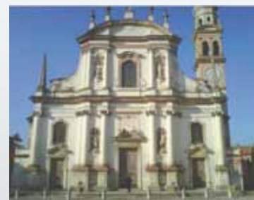
Parrocchia di Crespino Rovigo