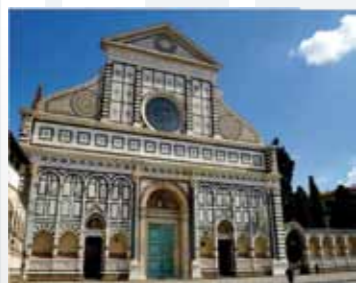
Opera Santa Maria Novella Firenze