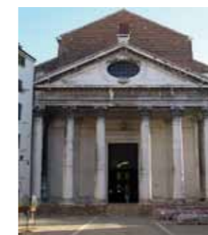
Chiesa dei Tolentini - Venezia