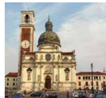
Santuario Monte Berico Rovigo