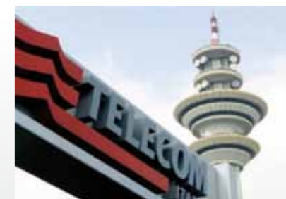
Telecom Italia Sede di Bologna