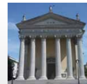
Parrocchia Santa Maria del Rovere - Treviso TV