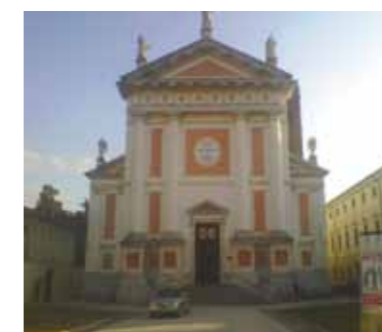
Duomo di Castelfranco Veneto