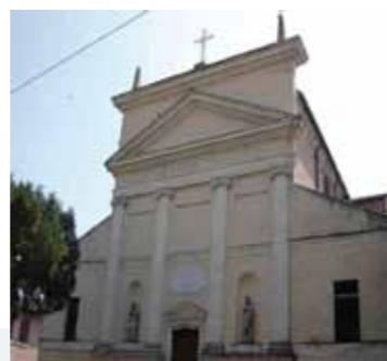
Parrocchia di Oppeano Verona