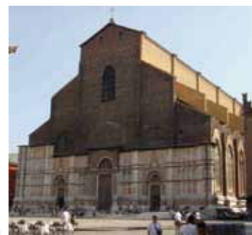
Basilica di San Petronio Bologna