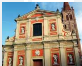
Parrocchia di Sant' Ambrogio Villanova di Castenaso BO