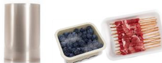
Traditional and compostable barrier films