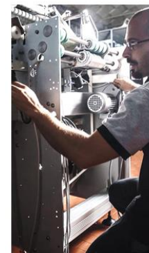
Widespread maintenance & service assistance Spare parts