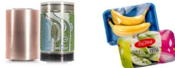
Plain and printed traditional stretch films