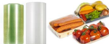
Plain and printed biobased and compostable stretch films