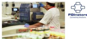
Automatic small footprint wrappers and weigh price label system for retail and small/medium packaging centers